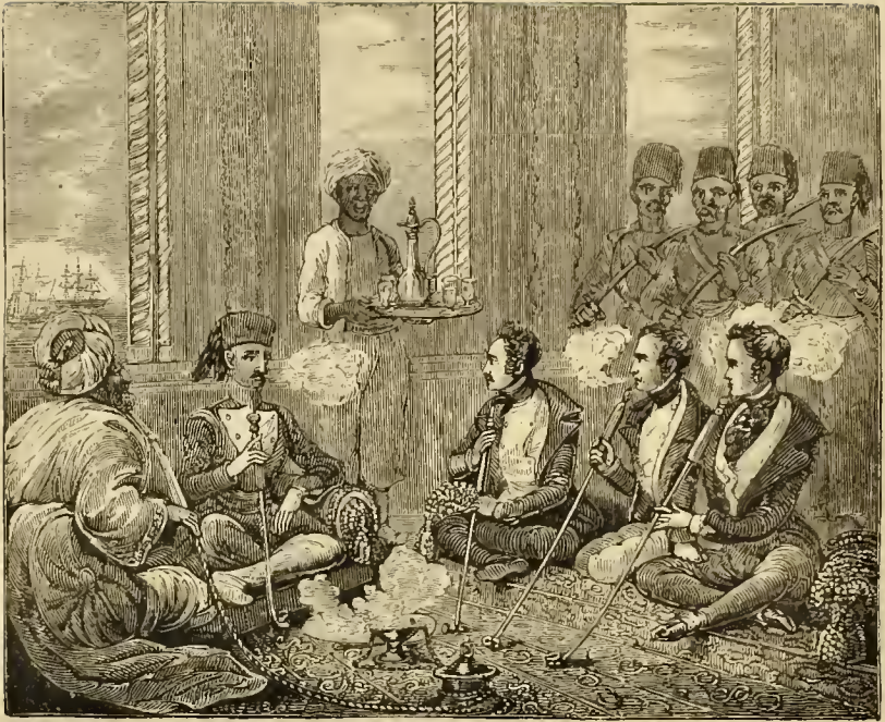
GIAOURS SMOKING THE TCHIBOUQUE WITH THE PACHA OF THE DARDANELLES.